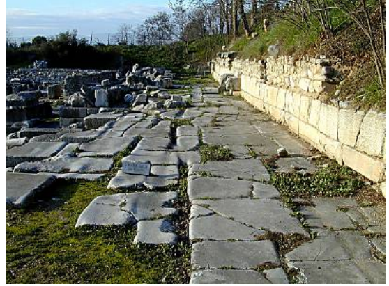
The Egnatian Way: The major Roman road that stretched across northern Greece through Philippi and Thessalonica.